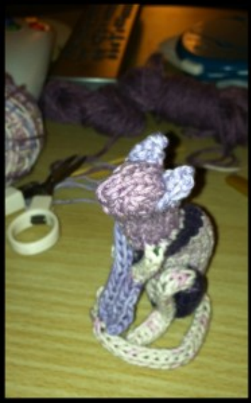
KnitCat looks Regal

No pattern, no picture, no guidelines—I remembered my various cats over the years and worked from that. It took me about ten hours over the course of the day to finish him.