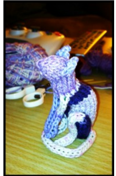
KnitCat Stares at Nothing

The migraines and vertigo are back with a vengeance, and I'm stuck in horizontal mode (laptop propped on lap and lying down as I write this, in fact).