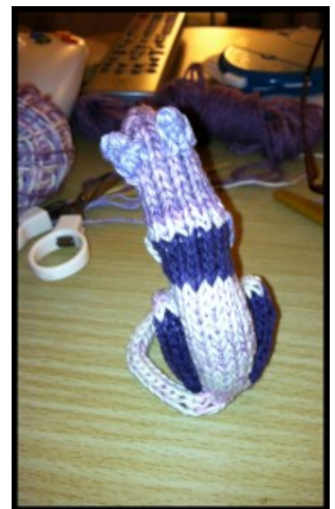
KnitCat watches Mad Men