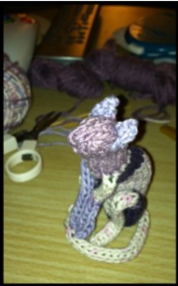
KnitCat looks Regal

No pattern, no picture, no guidelines—I remembered my various cats over the years and worked from that. It took me about ten hours over the course of the day to finish him.