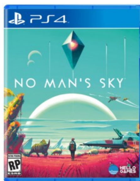
No Man's Sky

Before I review No Man's Sky, you need to know two things about me.