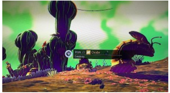
Planet of the Giant Bouncy Puppet Monsters

Two years ago, my younger son, then sixteen, told me about No Man's Sky .