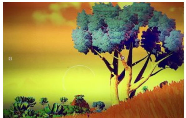
Beneath A Lemon Sky

...I became an alien. A stranger in a very strange land. And simultaneously discovered science fiction, in the form of a wonderful stack of YA books left behind by the previous children's home dorm parents.