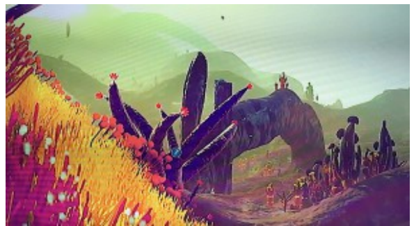
Not Kansas. And not Ohio, either, Dorothy.

And the two of us waited for it to come out.