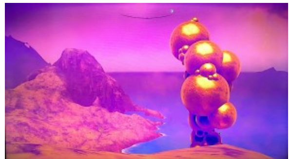
Useful, Necessary, Strange

Back then, girls went to college for their MRS degree (as in Mrs. Robert Biteme , for those of you who are female and young enough that you've grown up with the expectation of actually getting to use your own name your whole life).