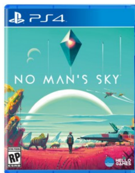
No Man's Sky

Before I review No Man's Sky, you need to know two things about me.