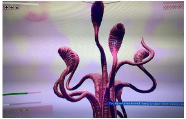
The tree has eyes!

ONE: Back in 1970 when I was nine, we moved from Ohio – where I'd spent my entire life to that point – to Alaska, and suddenly I was a nine-year-old girl living with my parents, little sister, and very little brother in a log-cabin boy's dorm heated by a wood-burning furnace on the tundra four miles by river from the nearest village (Kwethluk).