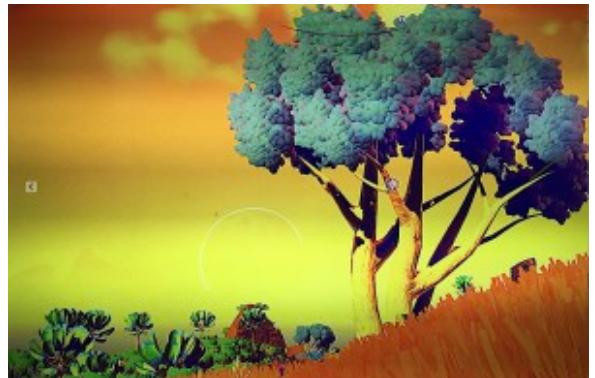
Beneath A Lemon Sky

...I became an alien. A stranger in a very strange land. And simultaneously discovered science fiction, in the form of a wonderful stack of YA books left behind by the previous children's home dorm parents.