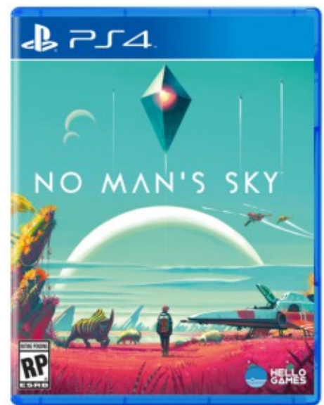
No Man's Sky

Before I review No Man's Sky, you need to know two things about me.