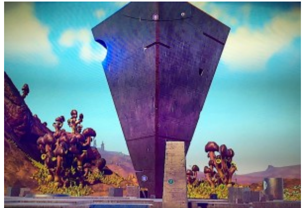
How to commune with aliens.

I figured out how to fix my ship, I got it airborne. I started discovering the planet on which I'd landed.