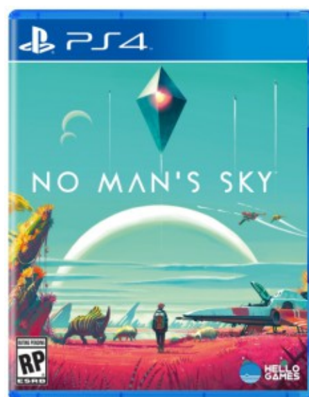
No Man's Sky

Before I review No Man's Sky, you need to know two things about me.