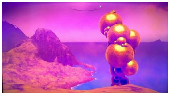
Useful, Necessary, Strange

Back then, girls went to college for their MRS degree (as in Mrs. Robert Biteme , for those of you who are female and young enough that you've grown up with the expectation of actually getting to use your own name your whole life).