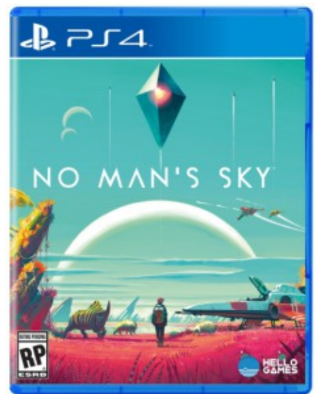
No Man's Sky

Before I review No Man's Sky, you need to know two things about me.