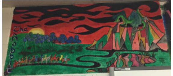
The Hobbit, 1979, crappy paint on cinderblock, Holly Lisle