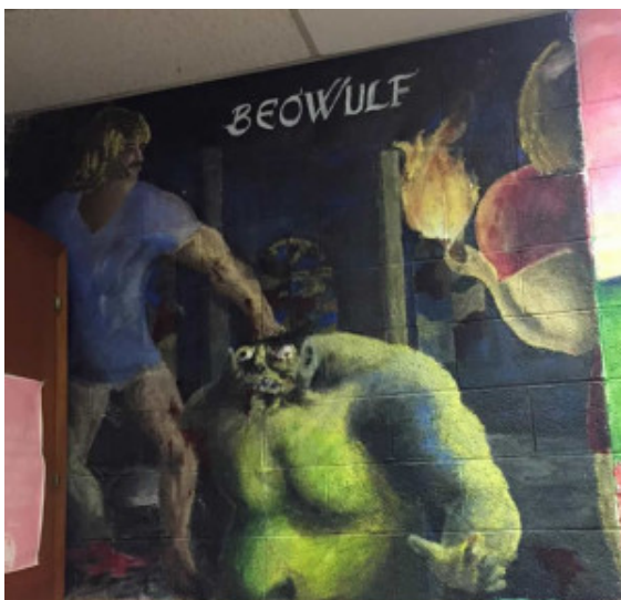
Beowulf, artist not known by me, from pre-1977.