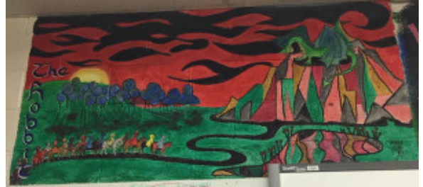
The Hobbit, 1979, crappy paint on cinderblock, Holly Lisle