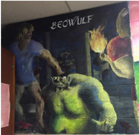
Beowulf, artist not known by me, from pre-1977.