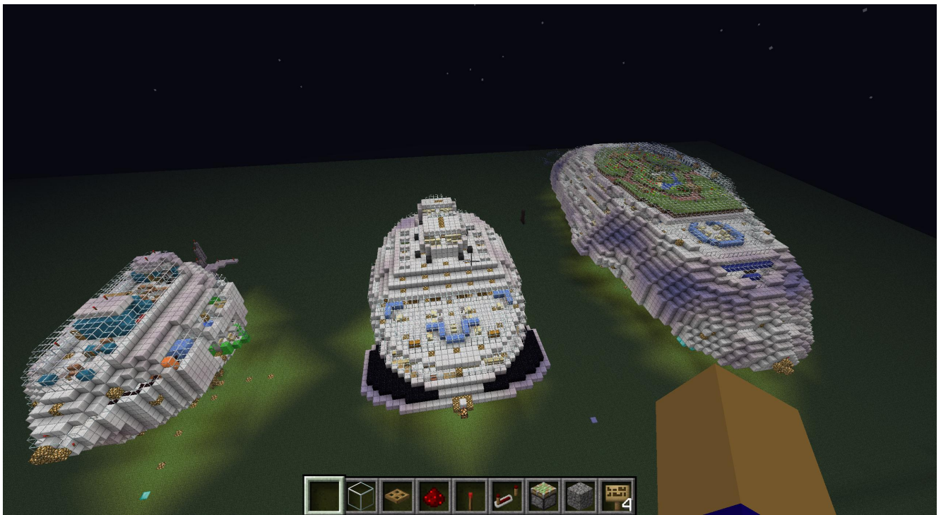
A closer look at the ships.

If you have Minecraft, you can get all of the for free from the following download page: