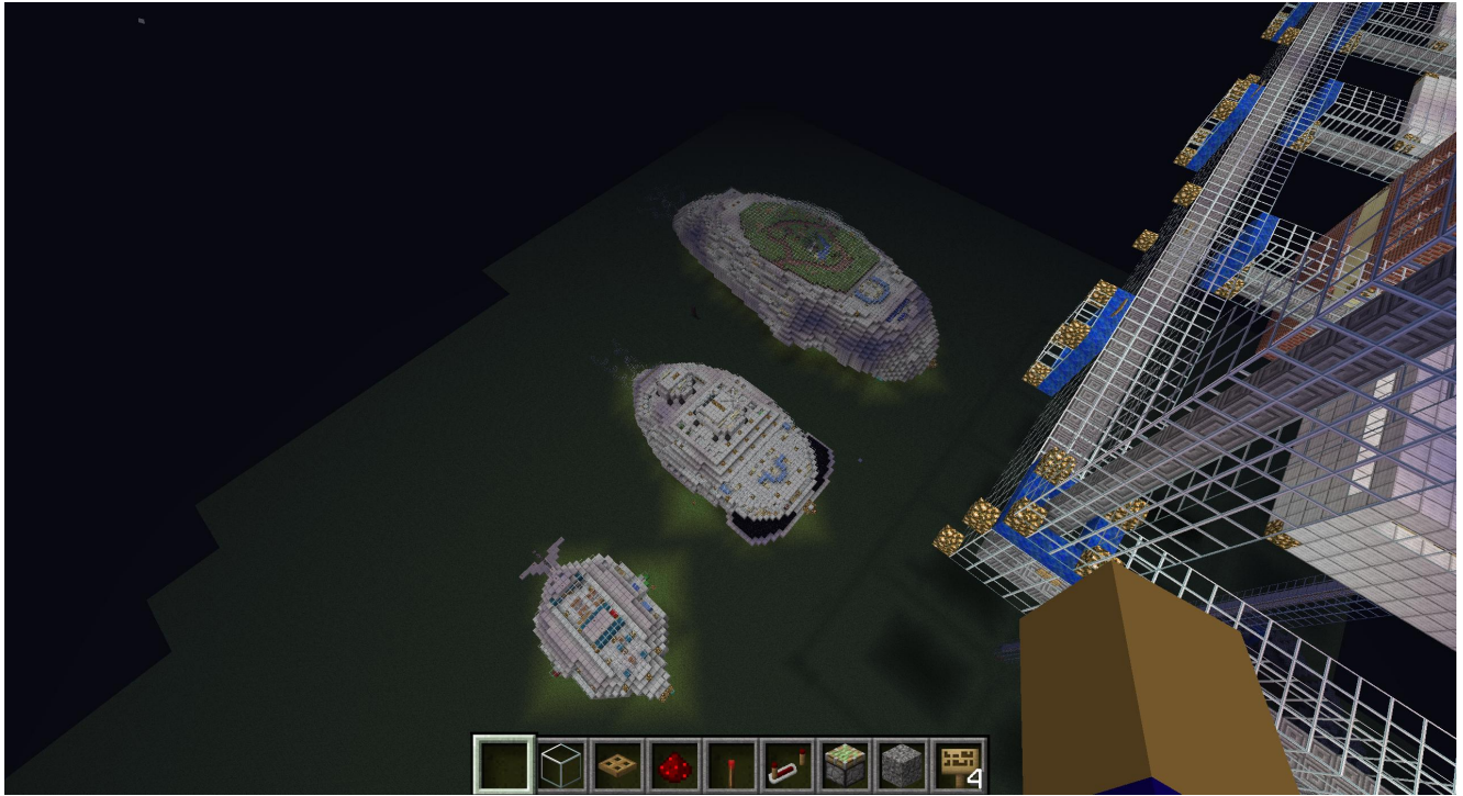
The spaceships from Bailey's Irish.